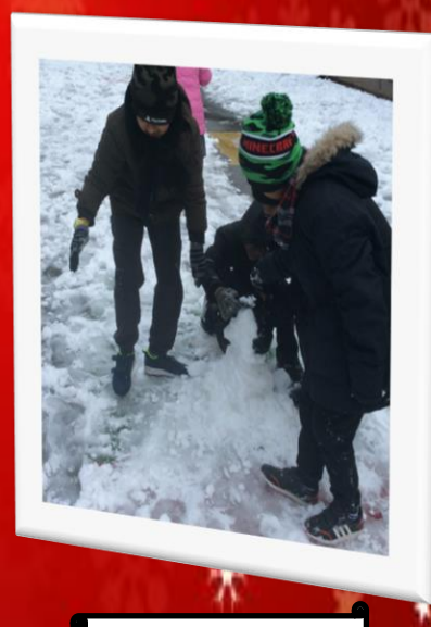
Fun in the Snow!