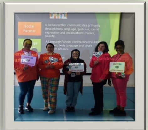
Staff in their bright colours