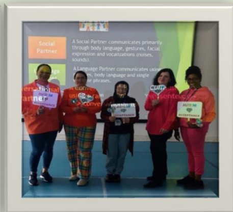
Staff in their bright colours