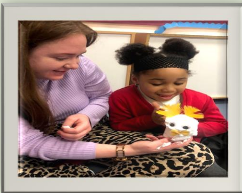
Attention Autism Group

Our school community participated in a range of activities throughout the week, including assemblies, classroom activities, intervention groups and a parent workshop. Staff received training on how to support the mental health and well-being of pupils with autism. On the final day of the week, we held a non-uniform day whereby staff and children wore bright colours to show their support for those on the autism spectrum. We were thrilled to have taken part in this event and to continue fostering an inclusive environment at our school.